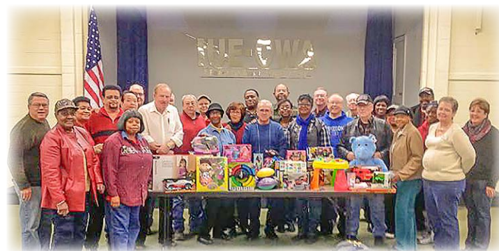
IUE-CWA Local 801 Retiree Club opening their hearts and giving to needy kids by providing a new toy to Toys For Tots.