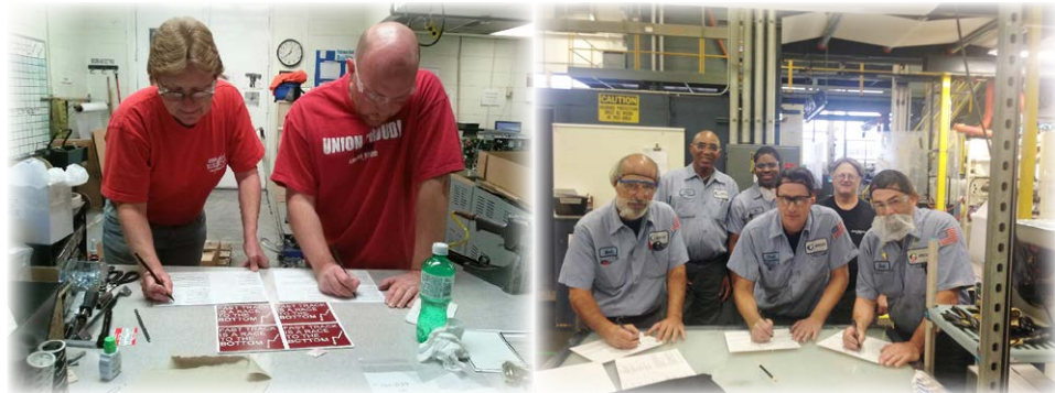
Members from IUE-CWA Locals 160 and 1101 getting the word out in their shops during the Stop Fast Track Week of Action--signing "No TPP" postcards

Since President Obama would certainly veto any such legislation, this proposed rule is not currently a threat to working people, but it does give us a window into Republican's views on labor law and their enforcement.