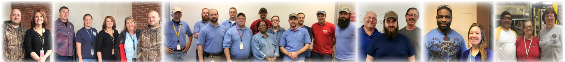
761 Ergo Cup