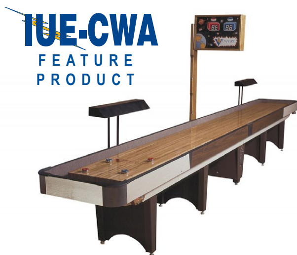
Pictured at left: Classic Coin – Shuffleboard Table