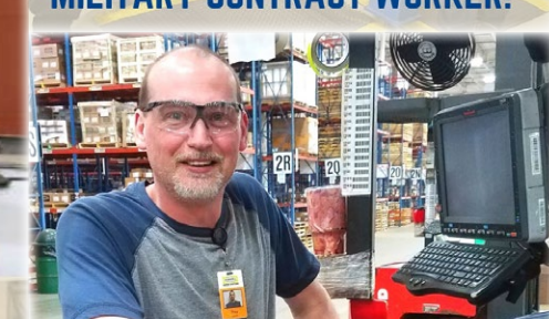
IUE-CWA FACTORY WORKERS KEEP OUR ECONOMY RUNNING!