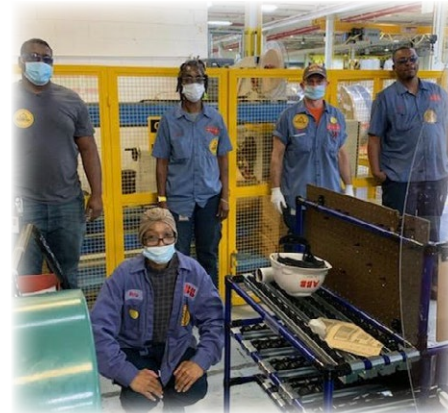
Members from Local 83799 at ABB Automation in Crystal Springs, Mississippi organized a day of action for hazard pay - all wearing "hazard pay now" stickers. Members from UAW and UE also participated!