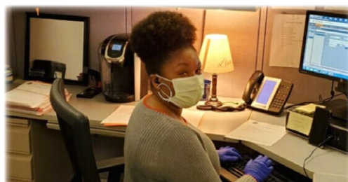
IUE-CWA THANK A SOCIAL WORKER!