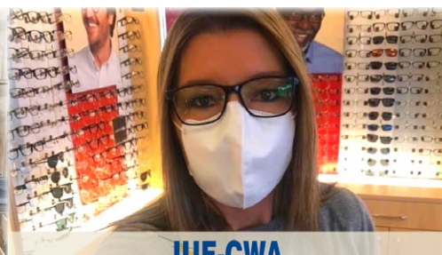
IUE-CWA THANK AN OPTICAL WORKER!