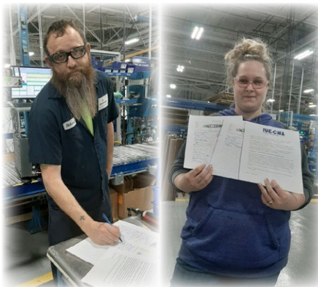
Members from Local 84725 at Emerson Climate Technologies in Sidney, Ohio signed a petition calling on the company to provide hazard pay in their shop. They got nearly 100% support from 700 members!