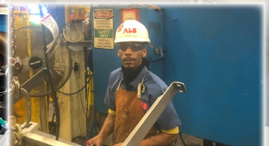
IUE-CWA FACTORY WORKERS KEEP OUR ECONOMY RUNNING!