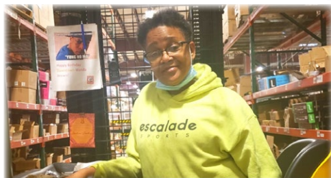
IUE-CWA FACTORY WORKERS KEEP OUR ECONOMY RUNNING!

IUE-CWA members are helping keep our country running! From factory workers to health care workers, military contract workers, optical workers, and social workers - IUE-CWA members are performing vital work across this country to keep our economy and communities going. All of us at IUE-CWA say THANK YOU to our members for your dedication and hard work! DON'T FORGET TO THANK A WORKER TODAY!! If you would like to submit photos of workers from your workplace to say "Thank you," please email the pictures, your Local number, and your workplace information to asnider@iue-cwa.org . Please check out our IUE-CWA Facebook page to see these photos posted online!