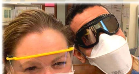
IUE-CWA THANK A HOSPITAL WORKER!