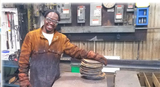
IUE-CWA FACTORY WORKERS KEEP OUR ECONOMY RUNNING!