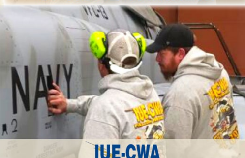
IUE-CWA MILITARY CONTRACT WORKERS KEEP OUR ARMED FORCES RUNNING!