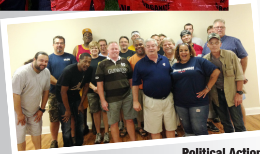
Political Action Bootcamp