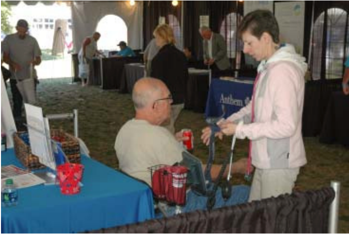
Among the many screening, retirees could get their blood pressure checked.