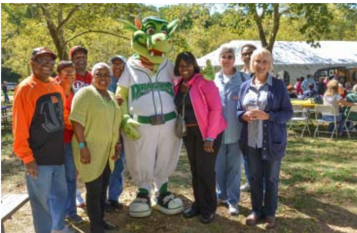
Dayton's minor league baseball mascot, Heater, wandered the grounds of Carillon Park, the historical museum that now houses IUE-CWA's Last Truck off the General Motors assembly line as well as documenting the region's rich history of innovation.