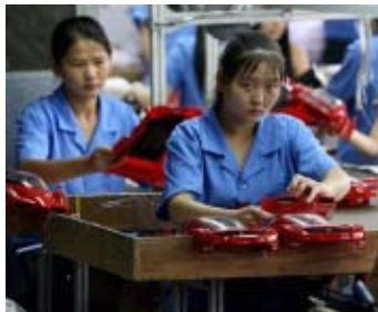
A worker in China makes the cheap plastic toys the country is known for.

The film is equally harsh on both Democrats and Republicans who sold allowing China's entry into the World Trade Organization as benefiting this country when all it did was allow