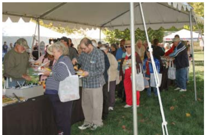
The chow line: so many turned out on the beautiful fall day that pizza had to be ordered to supplement.