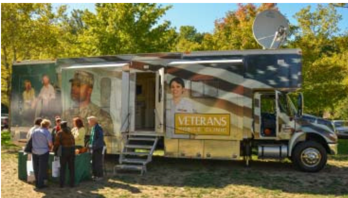
The Veterans Affairs Department worked with retirees who served in the military to ensure that they could receive all the benefits owed to them.